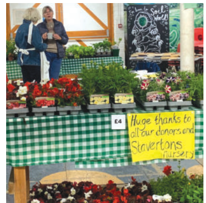
Top: Walk With Us event