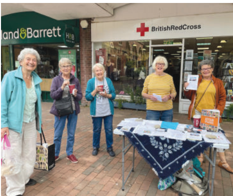
Above: Refugee Week Stall, Lewes Precinct